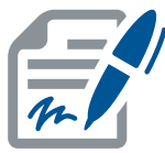
Exempt life insurance policy