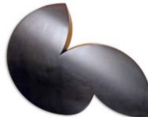
Second Chance —Travis Constance

We believe constantly evaluating the difference between price and value for each security in our portfolios is the best way we can deliver results for our clients.