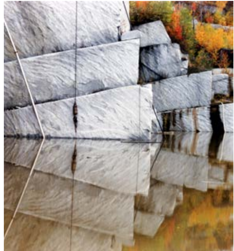
Rock of Ages

OUR FIRM'S INDEPENDENCE AND A TEAM APPROACH TO MANAGING PORTFOLIOS KEEP US SOLIDLY FOCUSED ON HELPING CLIENTS PURSUE THEIR INVESTMENT GOALS OVER THE LONG TERM.