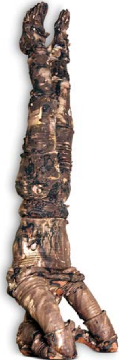
Standing Figure —Duane Brant

COMMITMENT TO OUR CLIENTS. CONVICTION IN OUR STRATEGIES.