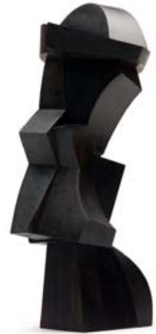
Negresse —Peter Ambrose

BRANDES' SINGULAR FOCUS ON VALUE INVESTING ENABLES US TO SERVE A VARIETY OF INVESTORS.