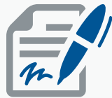
Tax-exempt life insurance policy