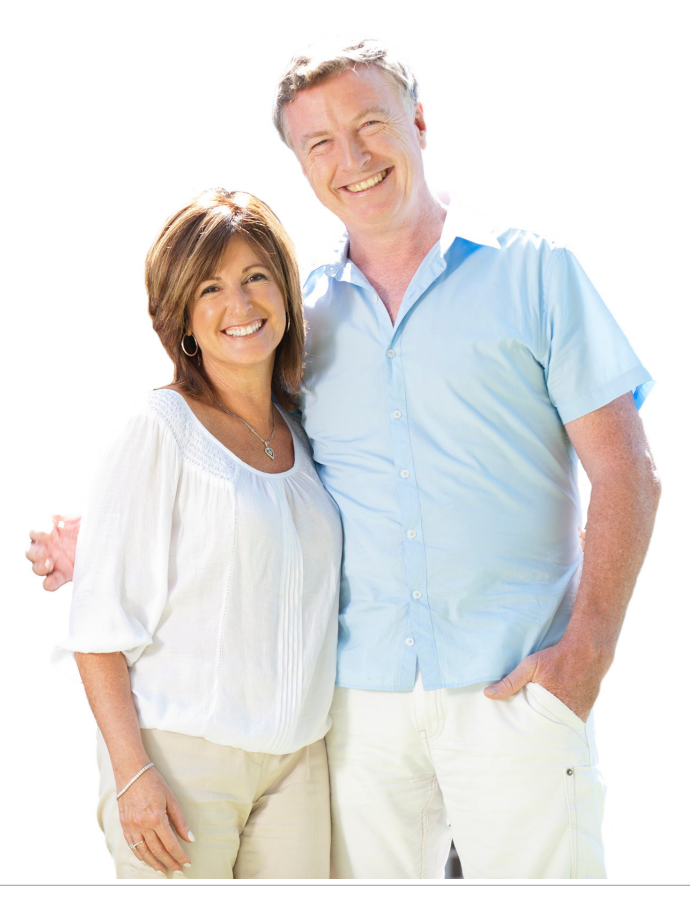
SEGREGATED FUNDS | Savings and Retirement